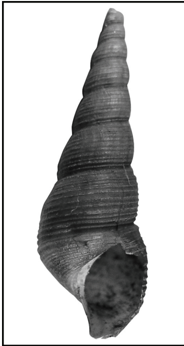
Figure 2. Melanoides tuberculatus (Müller, 1774) from Iguazú National Park, Argentina: shell of an adult specimen (20.05 mm length).

The material collected (MLP N° 12576) is the shell of an adult specimen (figure 2), 20.5 mm in total length. The coloration is uniformly brownish without evident bands, similar to that of specimens recorded in Rio de Janeiro, Brazil (MLP N° 12574). Fifteen juvenile specimens, 1.33 \text{ mm} \pm 0.41 in total length (figure 3), were also collected at the same site; these were scattered on the basaltic substrate. Although the determination of juvenile specimens is not easy, in this case their size was much smaller than that of the native thiarid species ( Aylacostoma spp.), whose minimum size at birth is between 7 and 8 mm (Castellanos, 1981). In contrast, the young M. tuberculatus are between 2.4 and 3 mm at birth (Quintana et al. , 2001-2002), much more similar to the dimensions recorded for our materials.