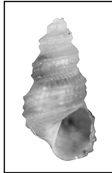
Figure 3. Melanoides tuberculatus (Müller, 1774) from Iguazú National Park, Argentina: shell of a juvenile specimen (2.18 mm length).

approximately 300 km away, one of them, upstream, to the NE of the new site, in Paraná state, Brazil (Londrina, Sertajena and Sertanópolis), and the other, downstream, to the SW, in Posadas, Argentina. Some populations have also been recorded in Santa Catarina State, Brazil, in environments that are not part of the Iguazú basin, but are close to the headwaters of this river. However, no specimens of M. tuberculatus were recorded in our samplings on the Upper Iguazú River. It is noteworthy that nine hydroelectric dams have been built on the upper course of Iguazú River in Brazilian territory whose reservoirs are exploited for aquaculture and aquarism. These types of artificial environments favour the colonization of opportunistic species, as the case of M. tuberculatus in Posadas. Pointier et al. (1993) and Rocha Miranda & Martins Silva (2006) mentioned that the populations of M. tuberculatus occurred mainly in backwaters and shady areas with fine sediment (organic detritus). However, as it was noted in this work and by Giovanelli et al. (2005) this